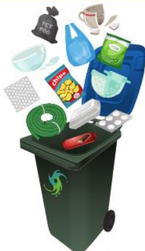
140L – blue lid bin