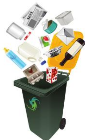
240L – yellow lid bin