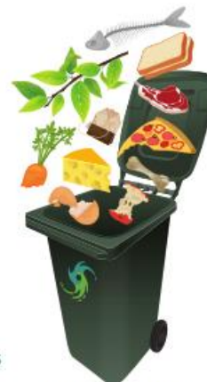
240L - green lid bin