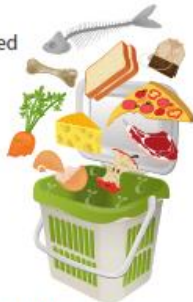
CATCH IT IN A CADDY

USE compost bins and worm farms as another alternative to recycle most food scraps and return valuable compost to your soil. Last resort dispose of in the general waste to landfill bin.