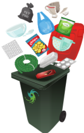
140L – red lid bin