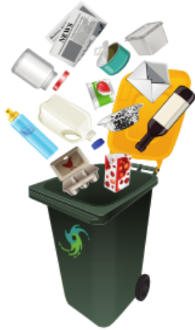
240L – yellow lid bin