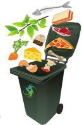
240L - green lid bin