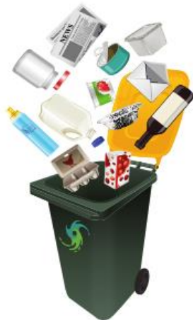
240L – yellow lid bin