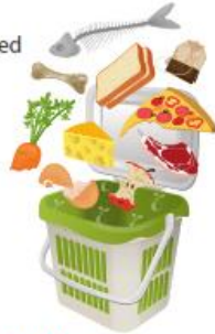
CATCH IT IN A CADDY

USE compost bins and worm farms as another alternative to recycle most food scraps and return valuable compost to your soil. Last resort dispose of in the general waste to landfill bin.