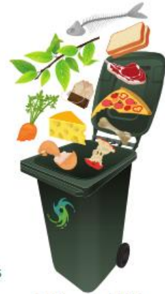
240L - green lid bin