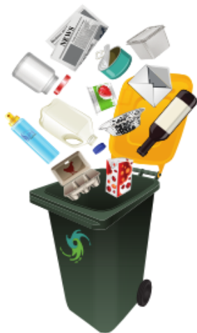
240L – yellow lid bin